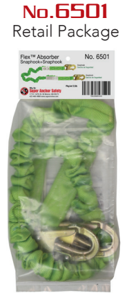
△ Retail Box