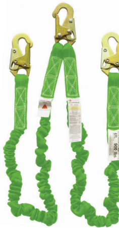
△ No. 6503