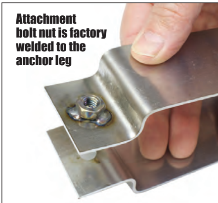
Attachment bolt nut is factory welded to the anchor leg