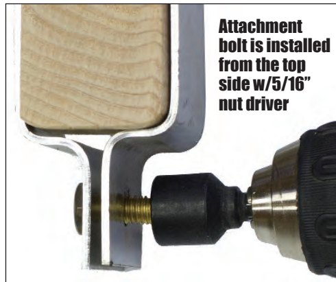
Attachment bolt is installed from the top side w/5/16" nut driver