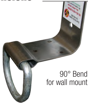
RS-20W No. 2816W