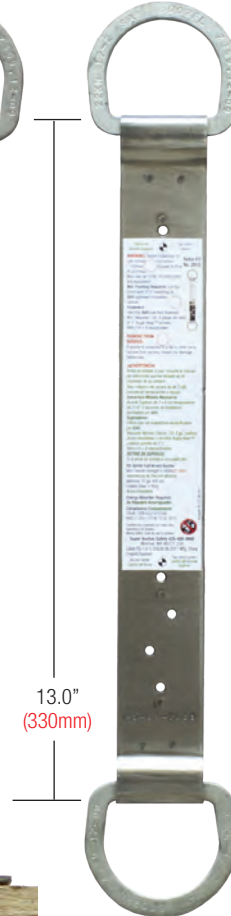
Retro-Fit™ No. 2815