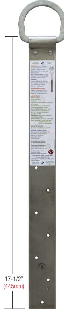
RS-20™ No. 2816