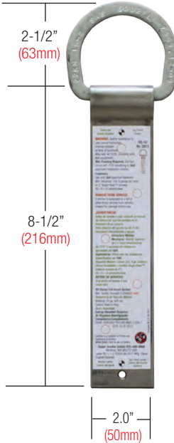
RS-10™ No. 2813