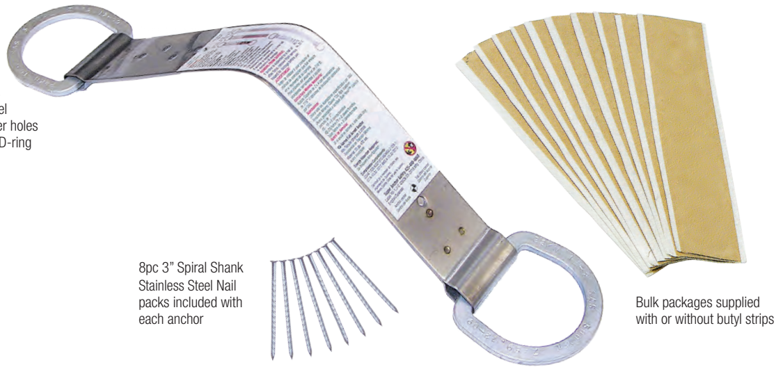
8pc 3" Spiral Shank Stainless Steel Nail packs included with each anchor

Canadian 3rd party engineering Certified by a member of l'Ordre des ingénieurs du Québec