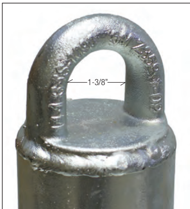
Loop Top Fixture 1091-S

Cast fixtures are fabricated as a single piece component that does not require forming and welding of bar stock. The streamline design is compatible with all PPE connectors and HLL accessories. Our cast loop tops consistently test at very high values of 10,000lb or more without fracture.