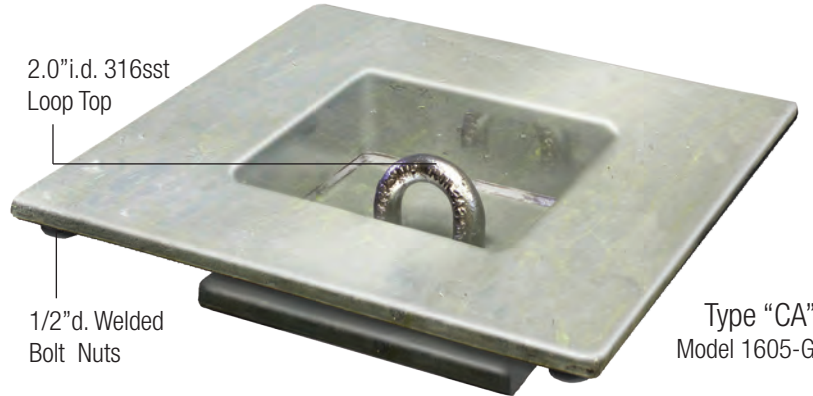
Type "CA" Model 1605-G