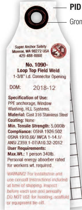
2 Inspection Labels