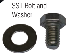
SST Bolt and Washer