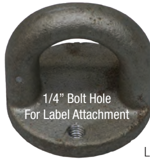
1/4" Bolt Hole For Label Attachment