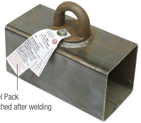
Label Pack attached after welding