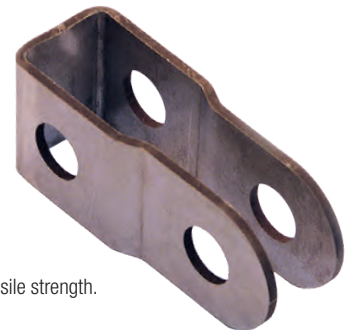
Jaw-Jaw 1058 galv. Turnbuckle