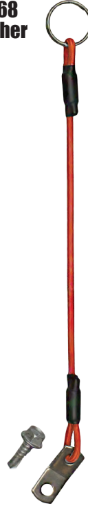
No. 2068 8" Tether