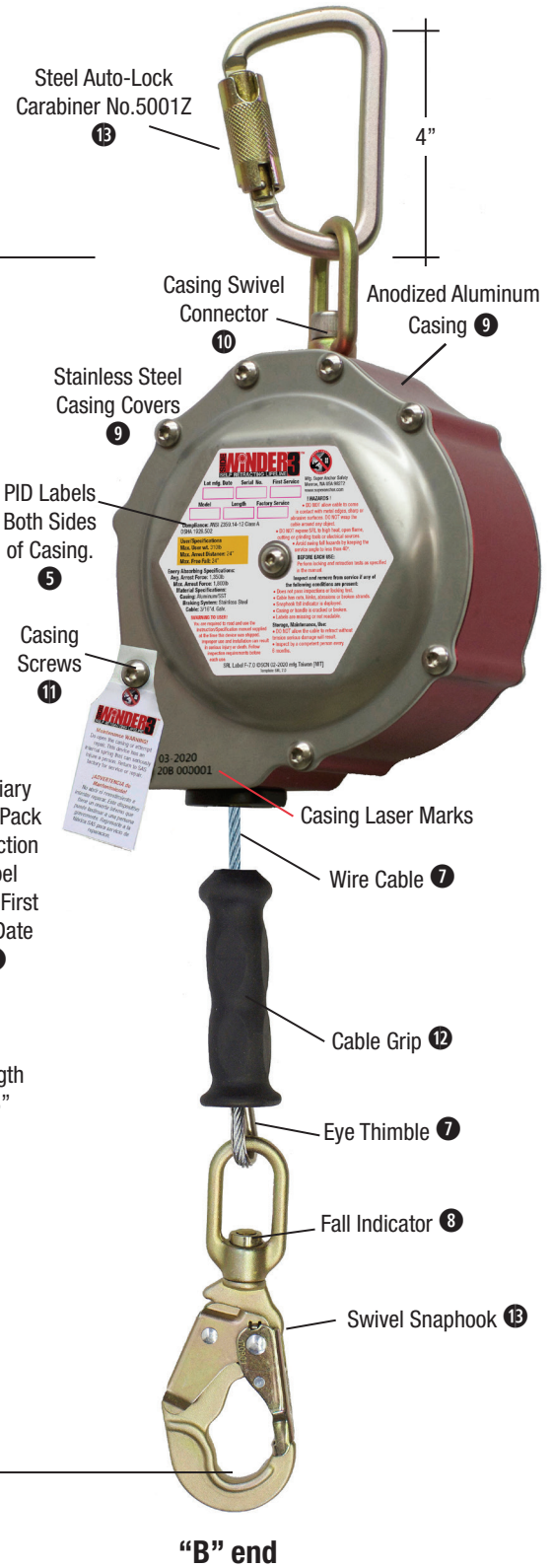
Fig.1A SideWinder3 “A” end

⊗ Inspection Points consult SideWinder2 manual pg.2