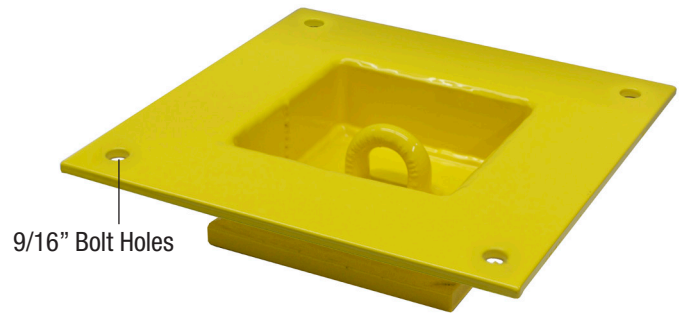
Type "B" Model 1604-TP