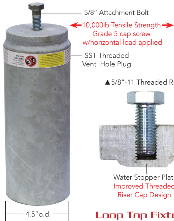
▲ 5/8"-11 Threaded Riser Cap