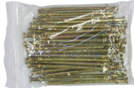
Zinc Coated Duplex Nails