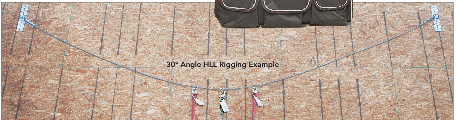
30° Angle HLL Rigging Example