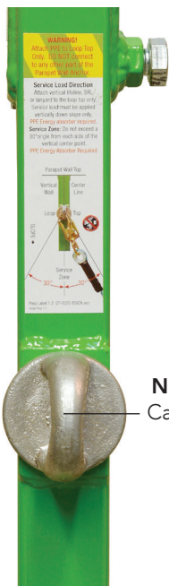
No.1090 Cast Steel Loop Top