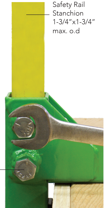
Safety Rail Stanchion 1-3/4"x1-3/4" max. o.d