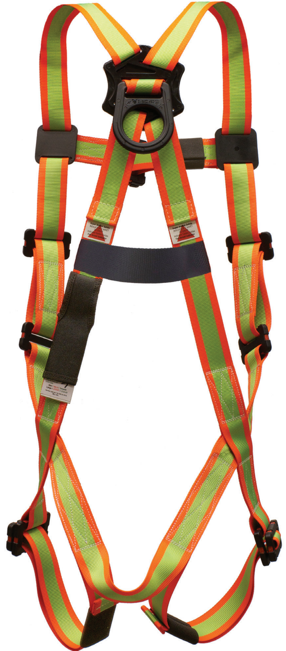
No.5018 Dielectric D-ring

Service Length 24.0" [61cm] wt. 28 oz [793g]