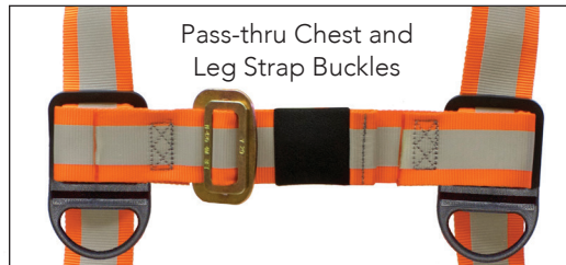
Pass-thru Chest and Leg Strap Buckles