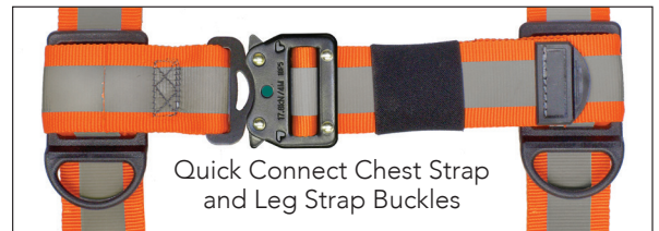
Quick Connect Chest Strap and Leg Strap Buckles