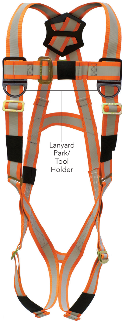
Lanyard Park/ Tool Holder