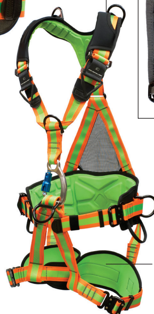
Heavy Duty Leg Pads