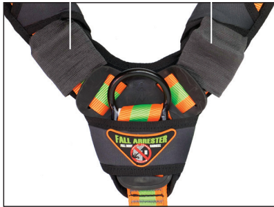
Shoulder Strap D-rings with Hide-away Elastic Keepers

Shoulder strap D-rings are designed for rescue and limited access. Elastic keepers are used to store the D-rings when not in use.