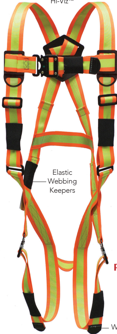
No. P6001-H Hi-Viz™