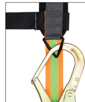
Deluxe Padded Frame