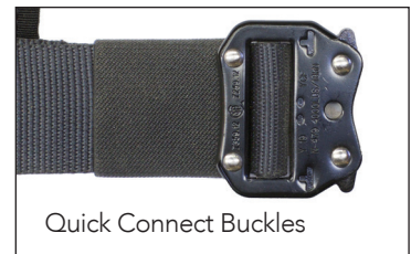
Quick Connect Buckles