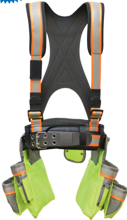
Ultra-Viz™ No.6402U 2-Pouch Tool Bag