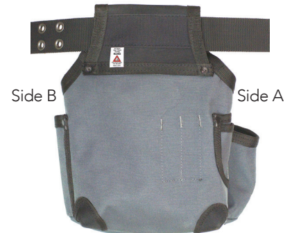
No.6453 3 Pouch