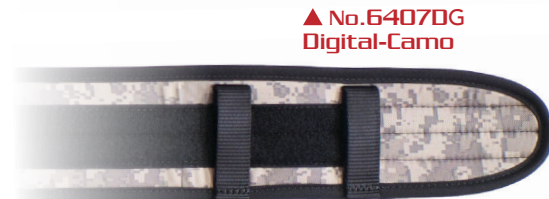
▲ No. 6407DG Digital-Camo