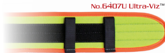
No. 6407U Ultra-Viz™