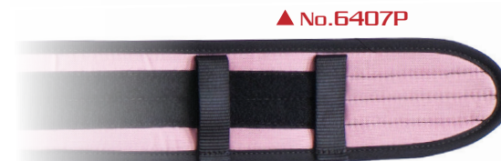
▲ No. 6407P