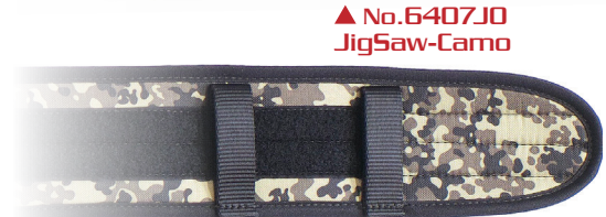
▲ No. 6407JO JigSaw-Camo