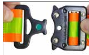
Quick Connect Buckles