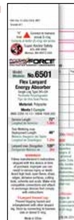
Annual Inspection Label