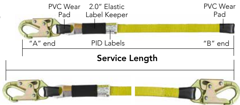
No.6014-72W w/B-end Snaphook