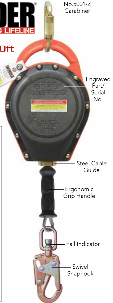
Steel Cable Guide