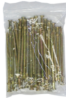
36pc Zinc Plated 16d Duplex Nail Packs

Dacromet Coating Rated 1,000hr Salt Spray