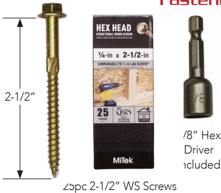
25pc 2-1/2" WS Screws