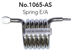
No.1065-AS Spring E/A