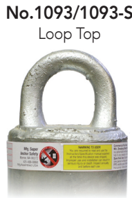
No.1093/1093-S Loop Top