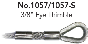
No.1057/1057-S 3/8" Eye Thimble

CRO couplers are specified for use with No.1093/1093-S 2" id. loop tops and are required for rigging HLL systems using CRO model anchors.