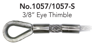
No.1057/1057-S 3/8" Eye Thimble