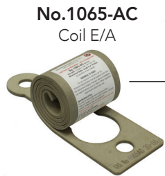
No.1065-AC Coil E/A