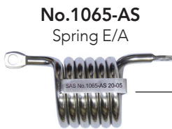
No.1065-AS Spring E/A