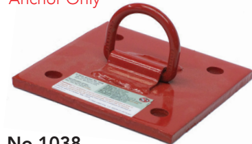
No.1038 Powder Coated Red w/Forged D-Ring Not rated for window washing

■ Standard Design Custom mfg. ▲ Stock Part. Note 1: Bolt, concrete embedment, expansion bolts or field welded. Note 2: Max. proof load 2,500lb. Note 3: Backer plates may be required for installation. *PC=Powder coated.