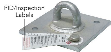
No.1037 No.1037-G5M/S5M 1-3/8" id. Loop Top Min. 10,000lb Tensile Strength Rated for Hoisting and Lifting