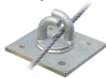
No.1037-P Pass-Thru Top Use for HLL Intermediate Anchor Only