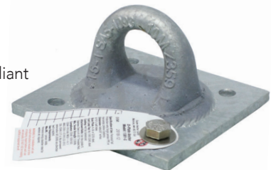
No.1301-G10M/S10M Rated for Hoisting and Lifting