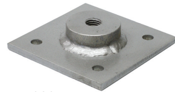
No.1028-DB6 5/8"-11x1" Threaded Top