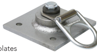
No.1028-DP6 5/8"-11x1" Threaded Top w/ No.1028 Swivel-D

ANSI Z359.18-17 Type A/T* CSA Z259.15:22 Type A/T* Window Washing: ANSI/IWCA I-14.1 OSHA 1926.502 *Request Intertek Lab Report