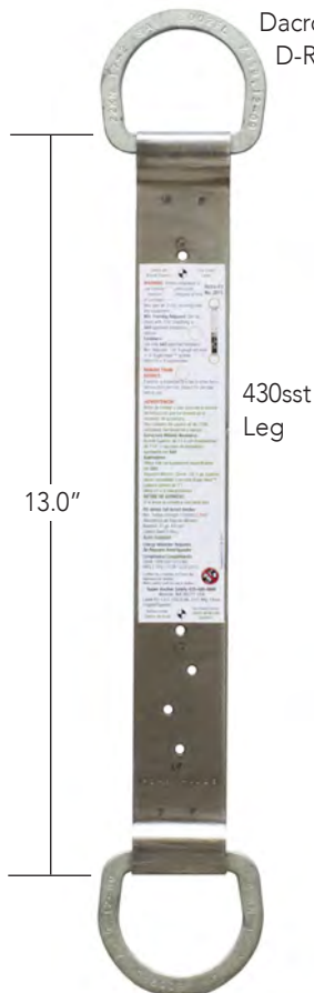
No. 2815 Most popular seller