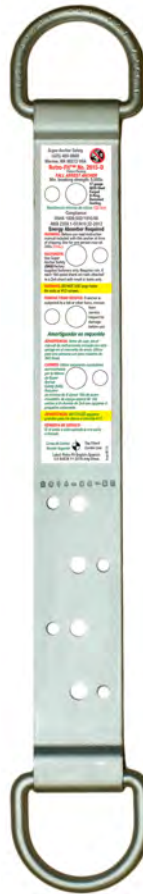
No. 2815-D 100% Dacromet Coated