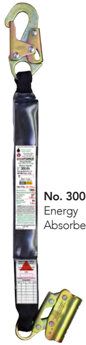
No. 3004 Energy Absorber