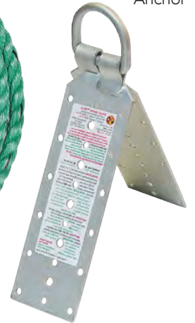
No. 3013-D Hinge-2 Adjustable Reusable Anchor