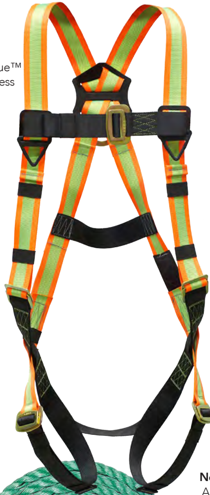
No. 6069 Value™ 5 point Harness