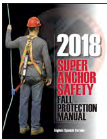
English/ Spanish 20 page manual