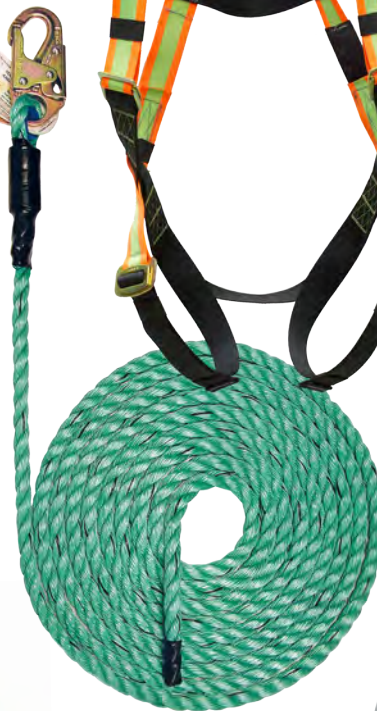
Maxima™ Co-polymer Lifeline