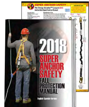
English/Spanish 20 page manual