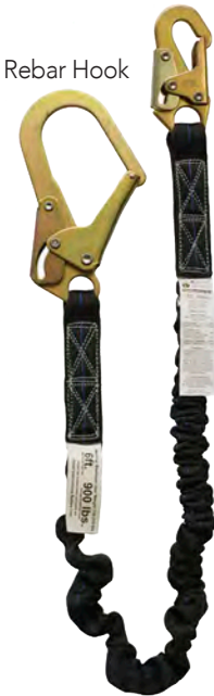
No. 6502 Flex Lanyard