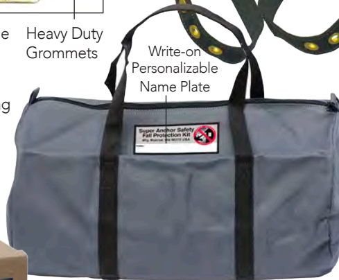
Write-on Personalizable Name Plate