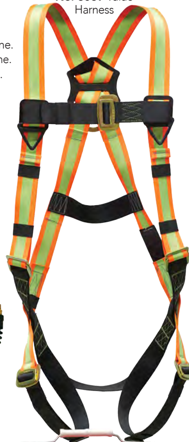
No. 6069 Value Harness