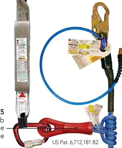
US Pat. 6,712,181 B2