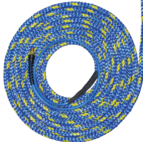
X-Line US Pat.7,814,938 B2