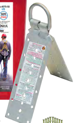
No. 3013-D Hinge-2 Reusable Anchor