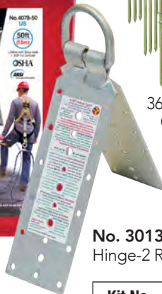
No. 3013-D Hinge-2 Reusable Anchor