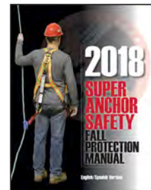
English/Spanish 20 page manual