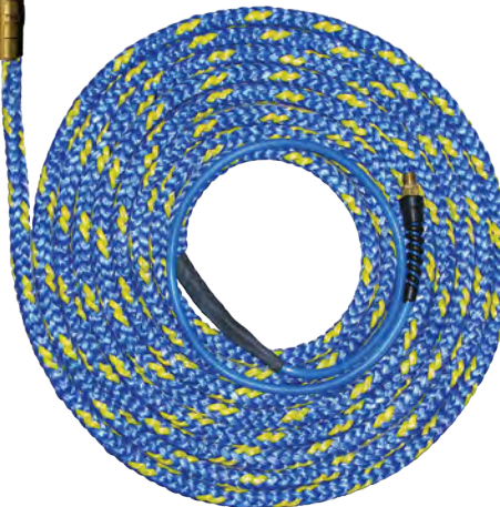
X-Line US Pat.7,814,938 B2