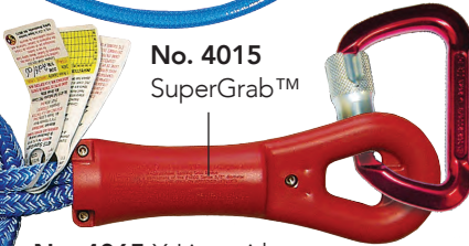
No. 4015 SuperGrab™