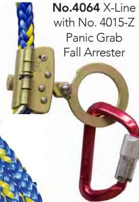
No. 4064 X-Line with No. 4015-Z Panic Grab Fall Arrester