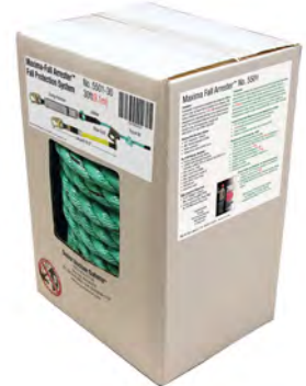
2018 20 page English/Spanish Manual