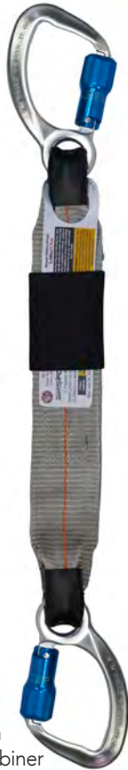
▲ Aluminum Captive Carabiner